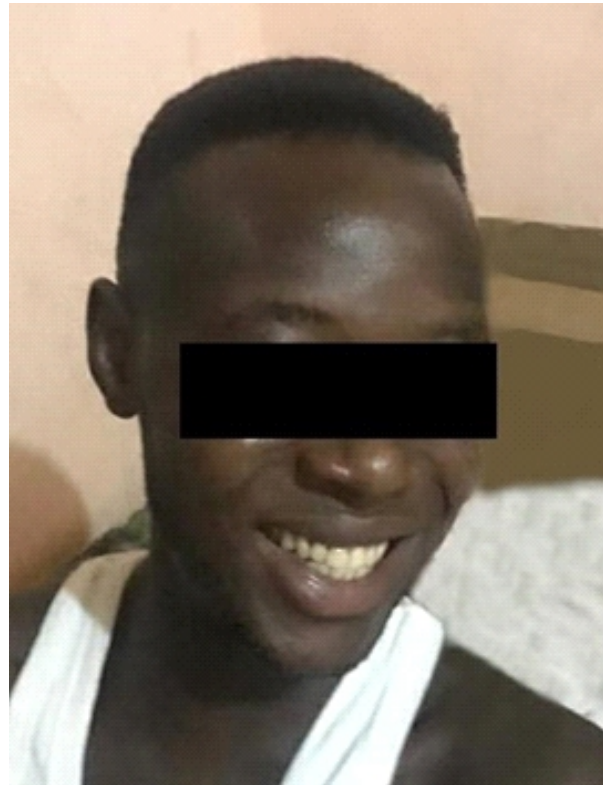
Figure 5: Patient, a month after post-op

The attending staff followed all the COVID-19 protocols, and the managing team was tested for COVID-19. However, one nurse tested positive and was made to self-isolate and started on appropriate medication.