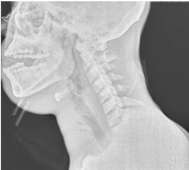
Figure 4. The lateral soft tissue of the neck radiograph shows a widening of the prevertebral shadow and a loss of normal cervical lordosis.

By the fourth day, the patient's WBC count dropped from 32 \times 10^9/L to 12 \times 10^9/L , which showed a general improvement in his condition. However, he started to complain of difficulty swallowing on the fourth day. An ENT consultation was sought, and a lateral soft tissue neck radiograph showed the presence of retropharyngeal abscesses (Figure 4). A physicianspecialist review was also sought where signs of reduced bilateral air entry were found. The patient subsequently started coughing out blood, with episodes of blood-containing sputum and vomitus.