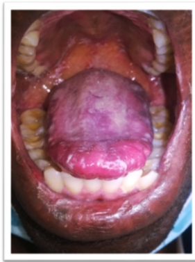
Figure 2: Oropharyngeal thrush